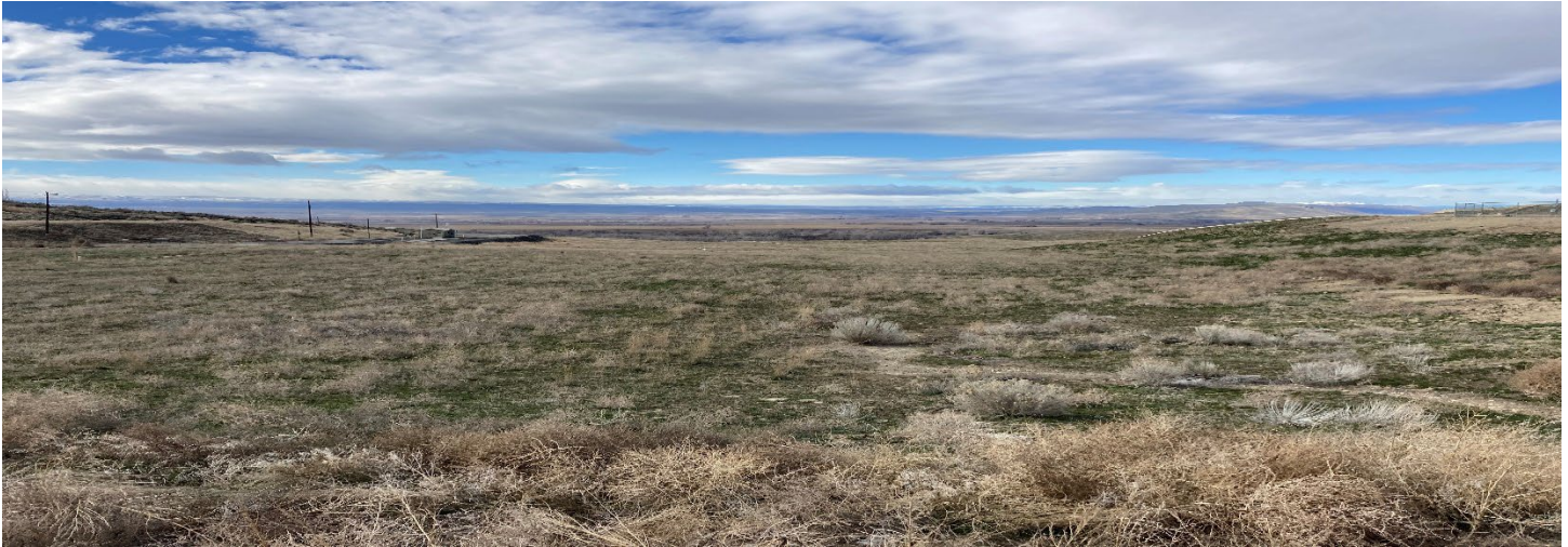
Snipes Mountain Landfill