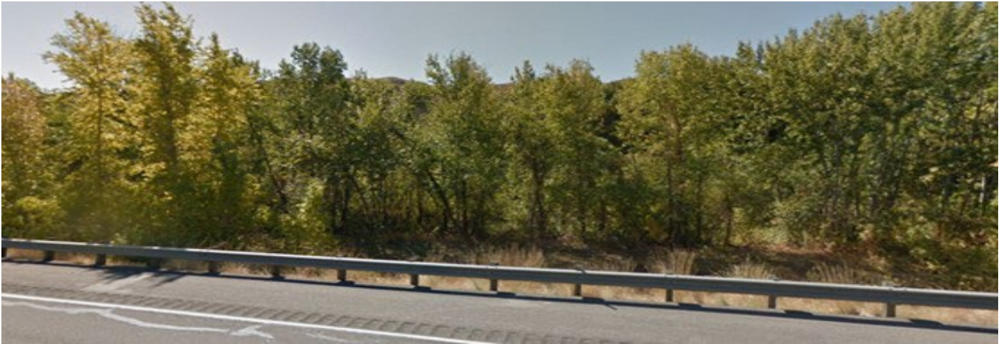
Pacific Pride Tanker Fire