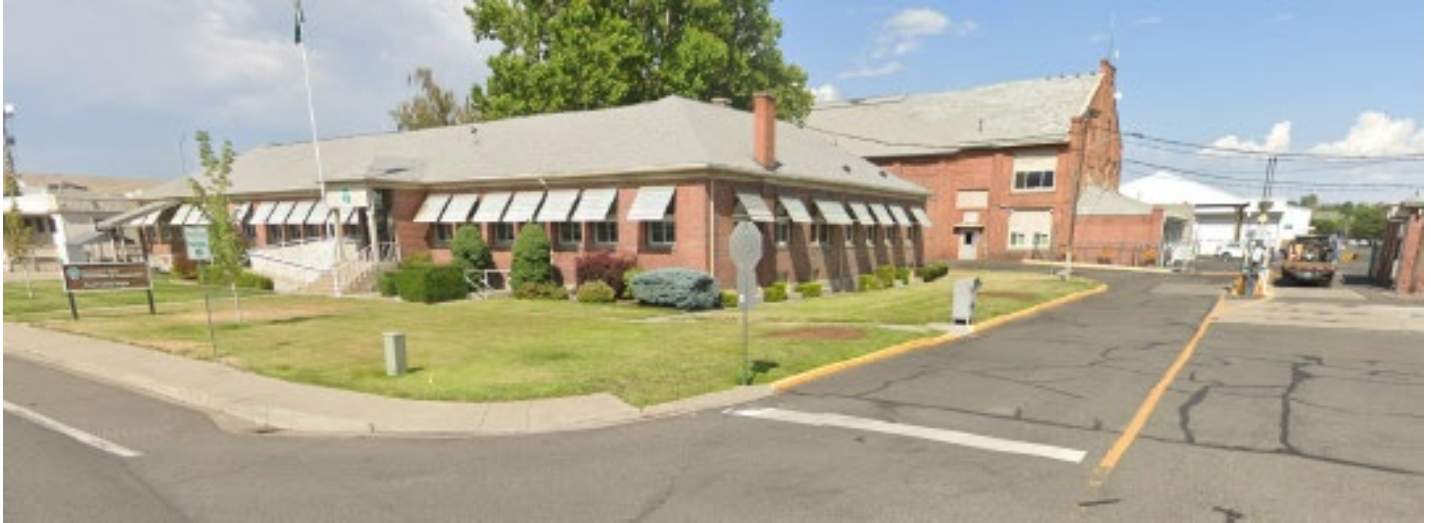
WA DOT Union Gap – Photo courtesy of Google Street View