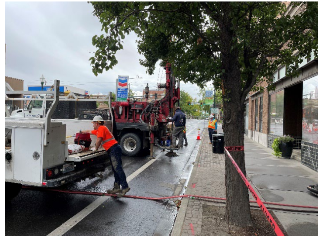
Figure 2. A cleanup contractor preparing to drill a monitoring and recovery well to find and pump spilled gas from groundwater during the spill response.

Mitigating potentially harmful vapors in the hotel and nearby building remains the highest priority, which is why Ecology issued an enforcement order so it will continue until we take over. Because the leaking tank has been emptied, removing the underground tanks will be postponed.