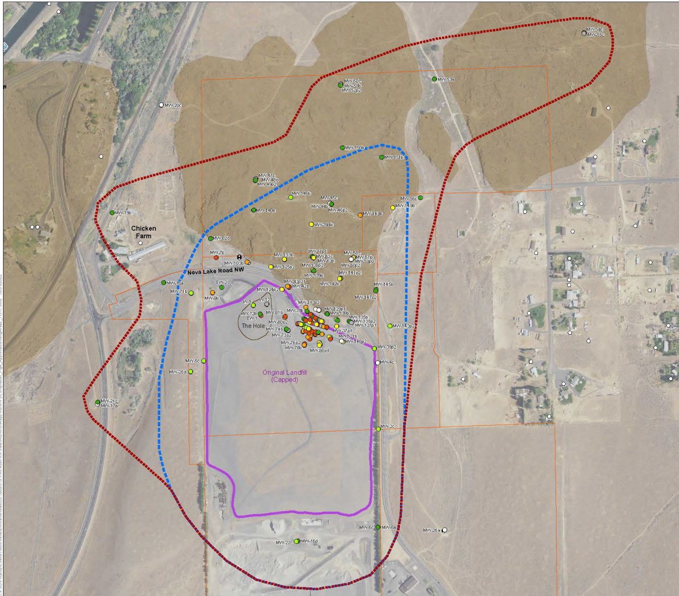
Figure 2. Approximate areas where contamination was found in groundwater Figura 2. Áreas aproximadas donde se encontró la contaminación en el agua subterránea

Ephrata Landfill Remedial Investigation & Feasibility Study Completion Grant County Public Works and City of Ephrata