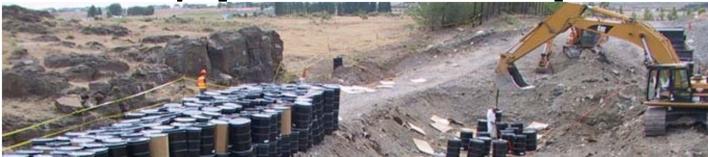
Drums of industrial waste were removed and properly disposed off-site in 2008.