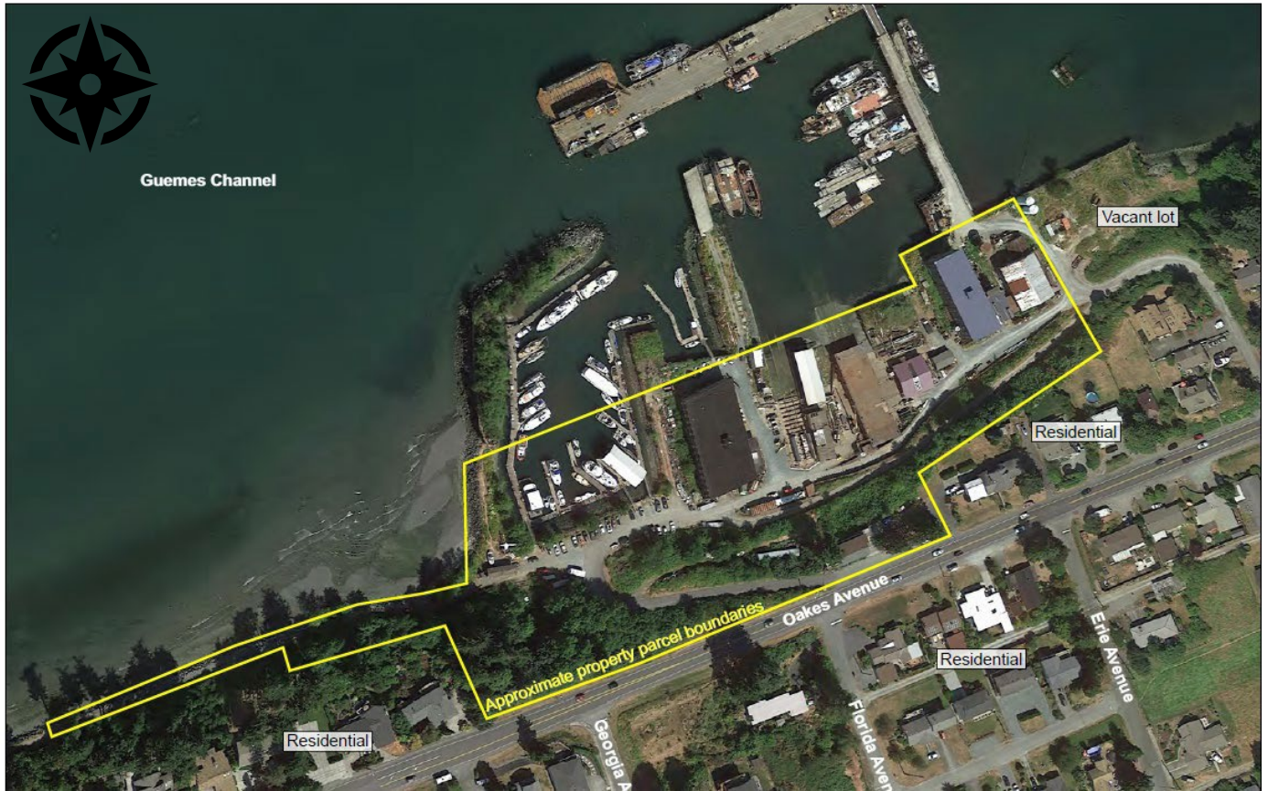
Figure 2. Map of the project area.