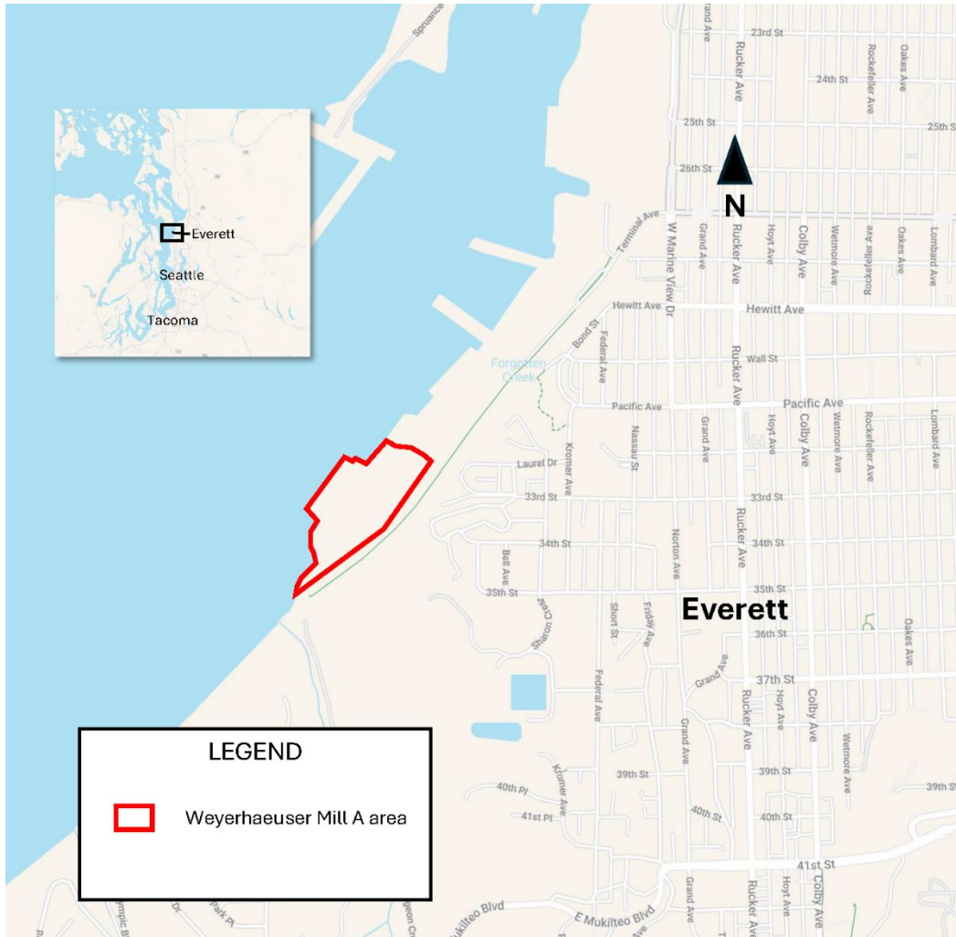
Figure 2: Map of Weyerhaeuser Mill A location. In-water work area is located to the west of the of the red line.