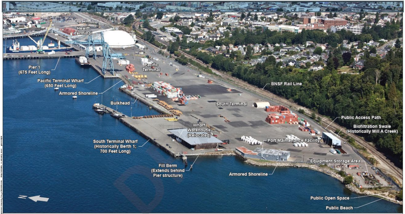
Figure 3: Weyerhaeuser Mill A map that shows both the in-water area and the attached uplands.