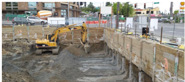
Remedial excavation in progress (2015)