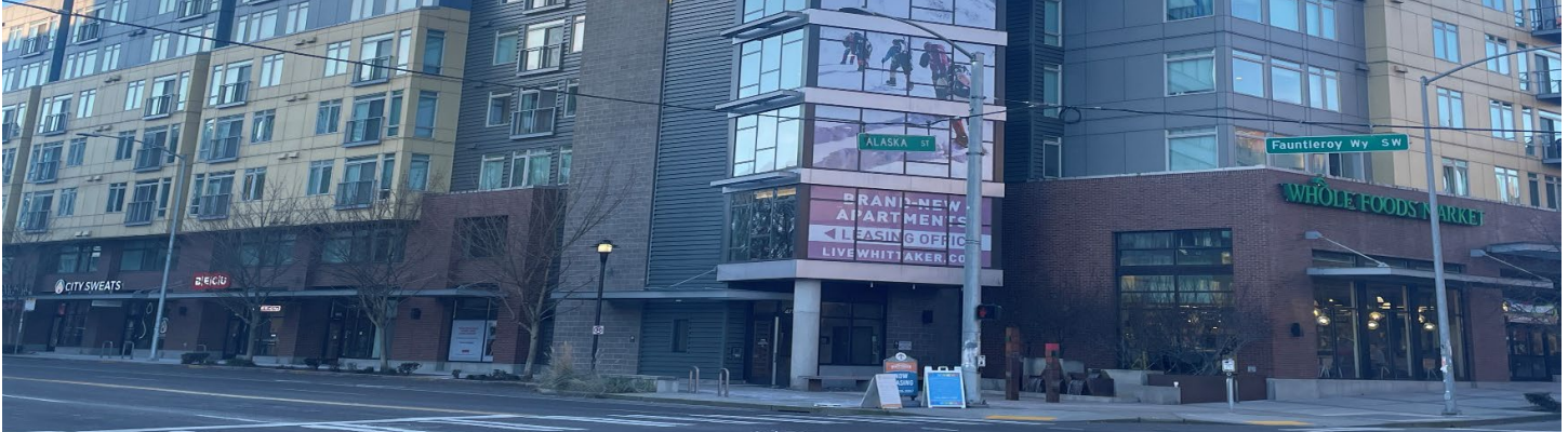
SKS Shell Station cleanup site today.