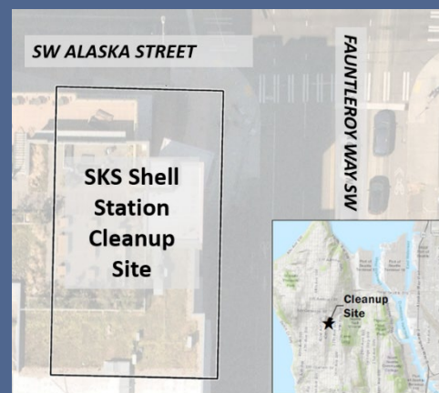
Aerial map of the SKS Shell Station cleanup site