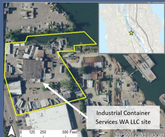
Aerial map of the Industrial Container Services WA LLC cleanup site.

To request an ADA accommodation, contact Ecology by phone at 425-229-3683 or email LDW@ecy.wa.gov , or visit ecology.wa.gov/Accessibility . For Relay Service or TTY call 711 or 877-833-6341.