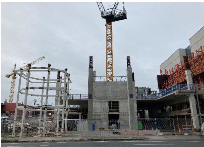
East side of 701 Dexter