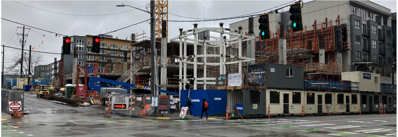
Construction Progress at 701 Dexter (February 2023)