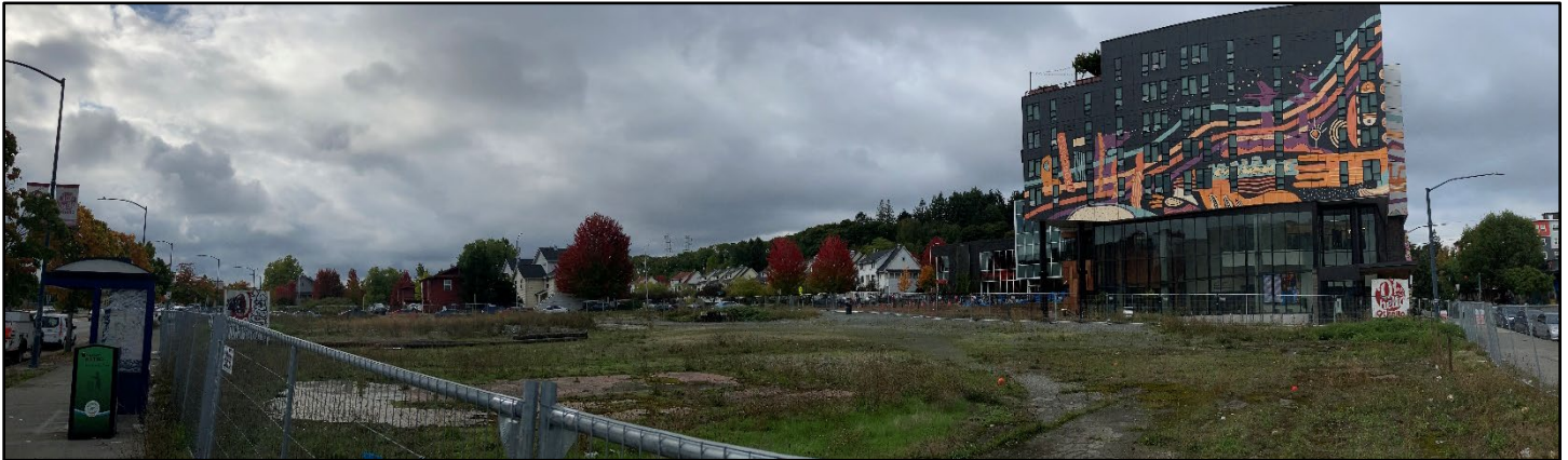
Holly Park Cleanup Site