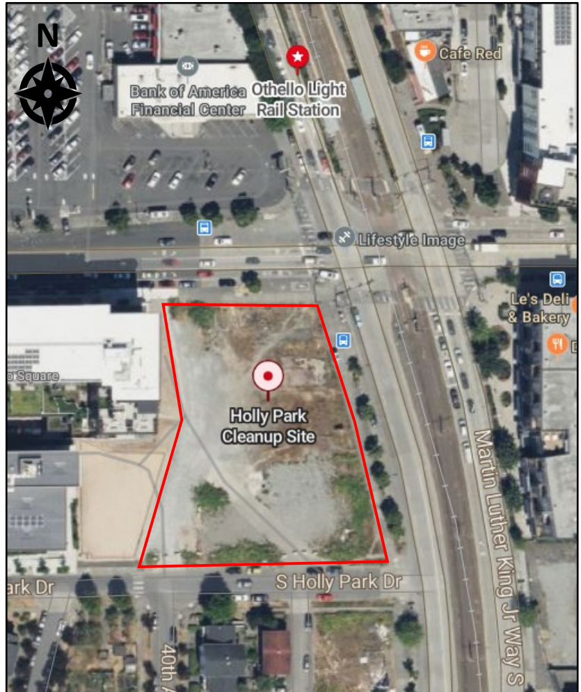
Aerial view of site

The need for a PPCD at this site arises from the historical uses at the property. It was a retail service station from the 1940s to 1979, fuel and heating oil facility from the 1960s to 1994, and had other commercial uses as well (retail, restaurant, and grocery). Demolition of buildings occurred between 2002-2005, and the property has been vacant since. These prior operations on the site have resulted in areas of petroleum contamination to soil and groundwater, the extent of which will be determined in the remedial investigation.