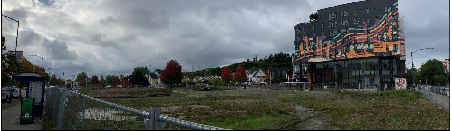
Holly Park Cleanup Site