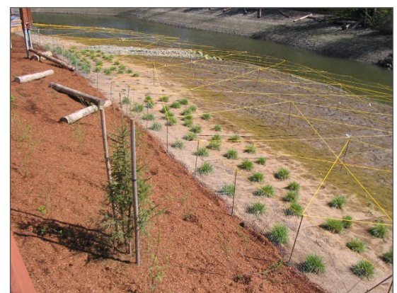
Northern Shoreline, 2005