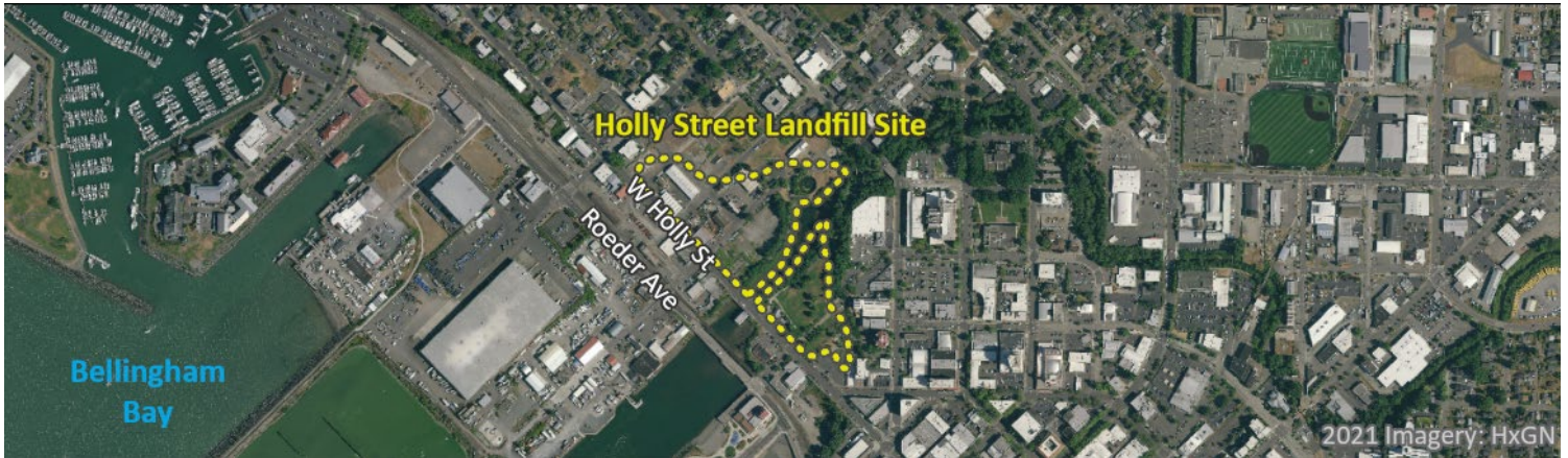
Aerial view of Holly Street Landfill Site