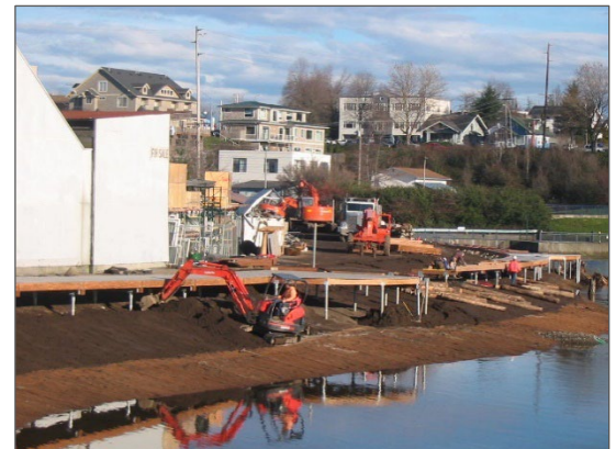
Northern Shoreline, 2005