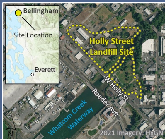
Aerial view of Holly Street Landfill Site

To request an ADA accommodation, contact Ecology by phone at 425-240-4353 or email at kristen.forkeutis@ecy.wa.gov , or visit ecology.wa.gov/Accessibility . For Relay Service or TTY call 711 or 877-833-6341.