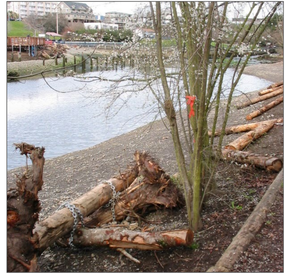
Southern Shoreline, 2005

The cleanup removed about 12,400 tons of solid waste, primarily from the northern bank prior to construction of the cap. The excavated materials were transported and disposed of at a permitted, off-site landfill. Along with the cleanup activities the City restored historically lost habitat at the mouth of Whatcom Creek. They converted about 0.3 acres from upland to intertidal elevations, created side channel habitat, placed large woody debris, removed invasive vegetation, and re-introduced native plants. In addition the City constructed a boardwalk and viewpoints/overlooks along the estuary to improve public access to the shoreline.