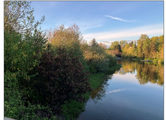
Northern Shoreline, 2024

Ecology will work with the City to gather this additional information.