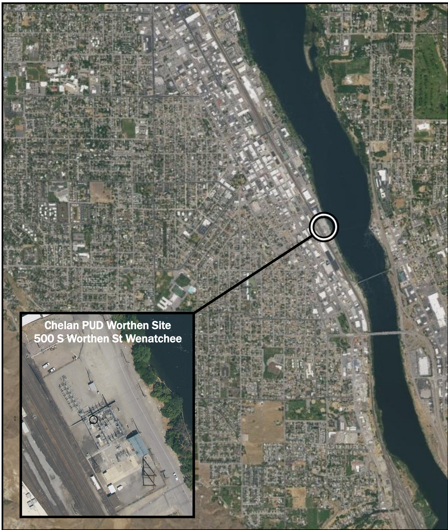
Aerial Image of Wenatchee with a Magnified Image of the Chelan PUD Worthen Substation Site