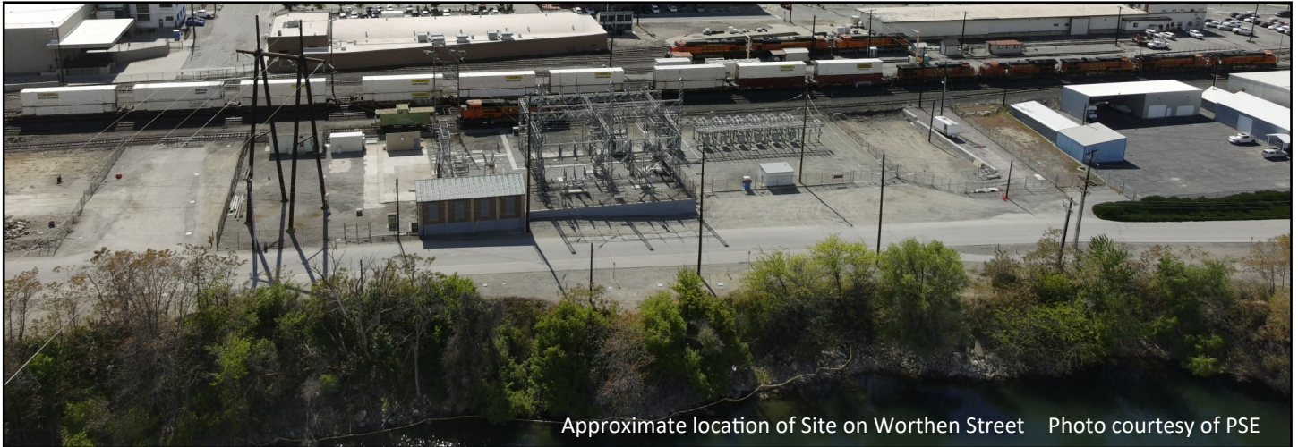
Approximate location of Site on Worthen Street