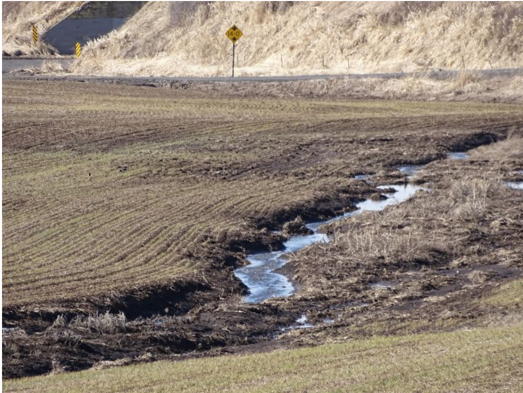
Figure 3: Dryland agricultural production adjacent to seasonal stream