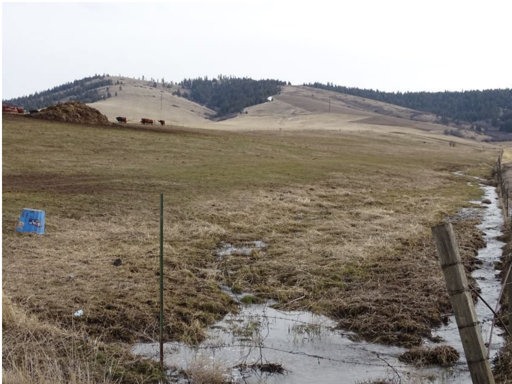
Figure 5: Livestock impacts to seasonal stream