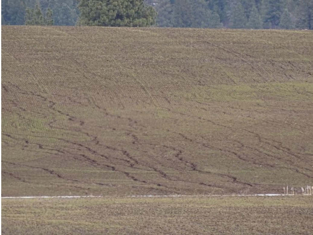
Figure 4: Gully erosion on dryland agricultural field transferring sediment to stream