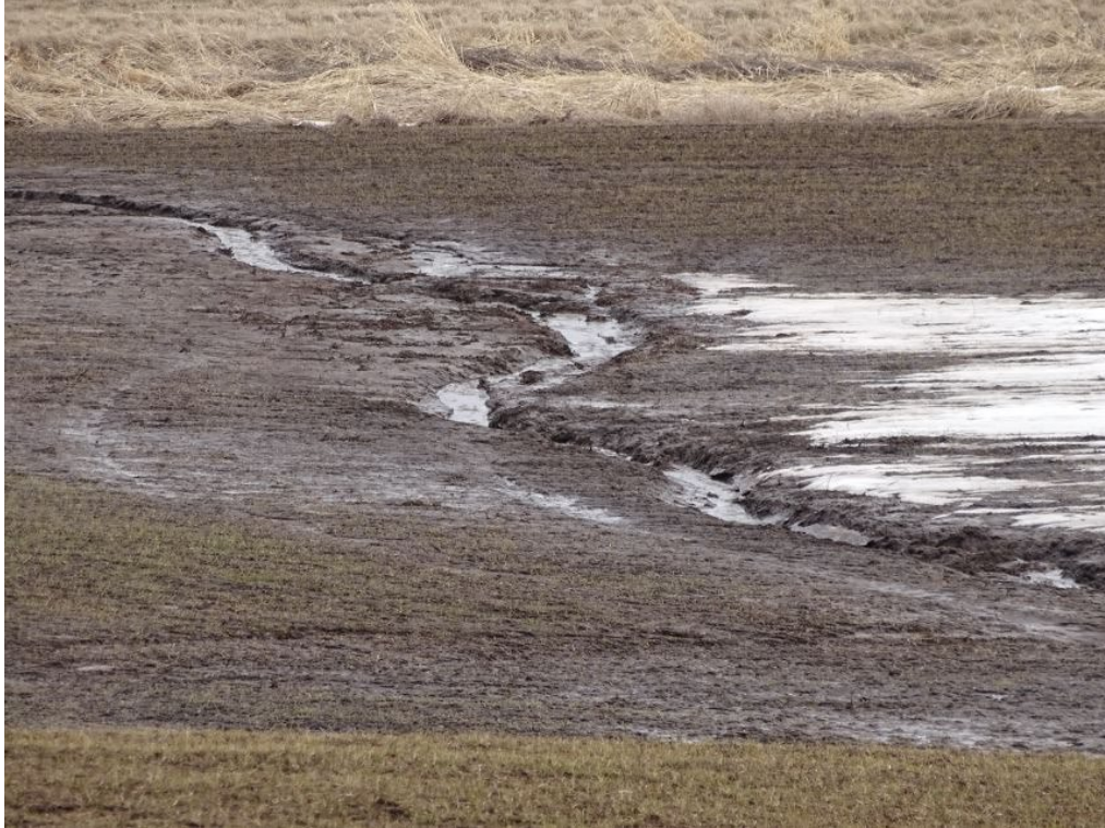
Figure 2: Gully erosion on dryland agricultural field transferring sediment to stream