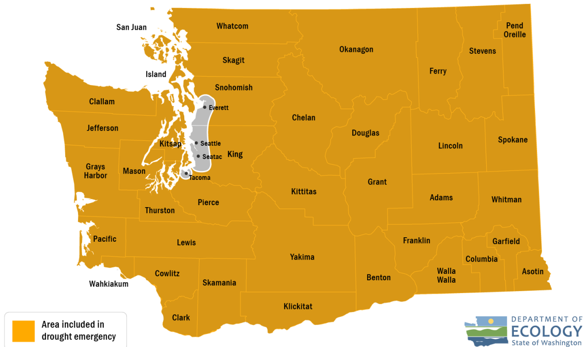
Figure 1. Map of the areas in the drought declaration issued April 16, 2024.

Note: The Drought Emergency Declaration includes all of the county for 36 of the State’s 39 counties, and most of Snohomish, King, and Pierce counties. Geographic areas in Snohomish, King, and Pierce counties are included in the Emergency Drought Declaration if they do not receive direct service for potable water through contract with the cities of Seattle, Everett, or Tacoma.