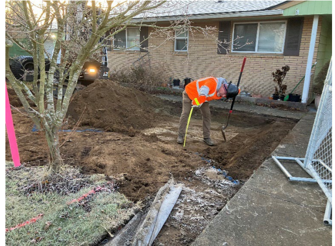
Figure 1: Contractor working on cleaning up lead and arsenic contamination left behind by the Everett Smelter

Ecology passes through most of the money we manage—approximately 70% each biennium—to