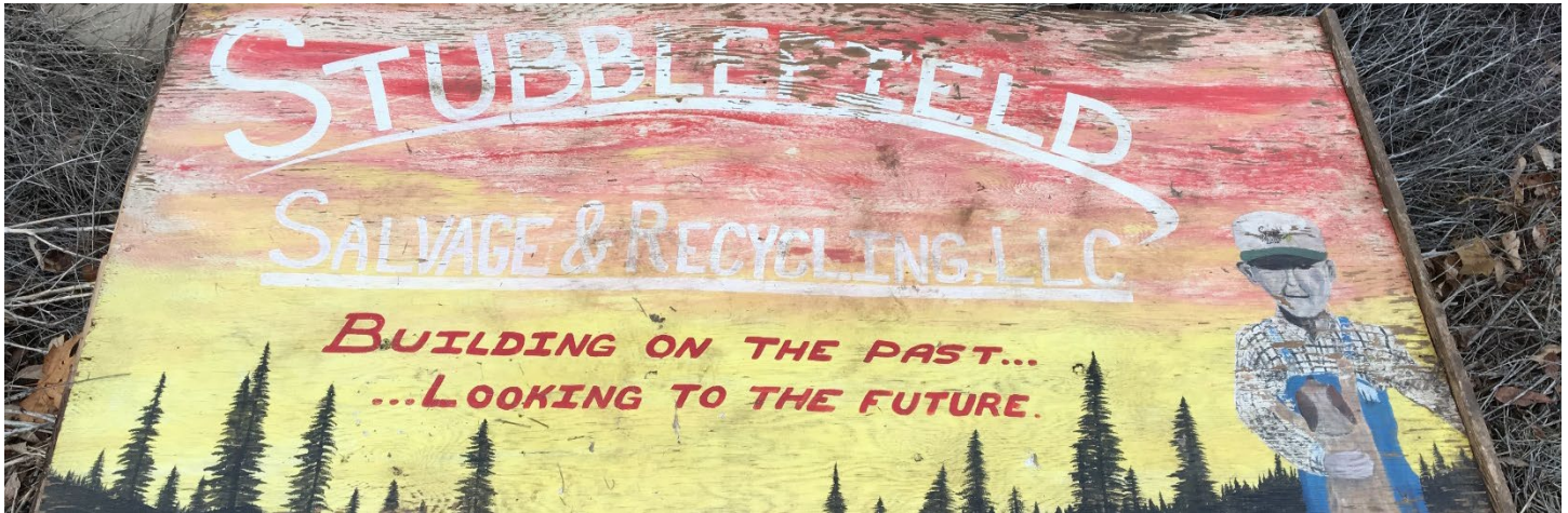
Figure 1. The Stubblefield Salvage Yard is being cleaned up by Ecology and the property owner, who plans to redevelop it.