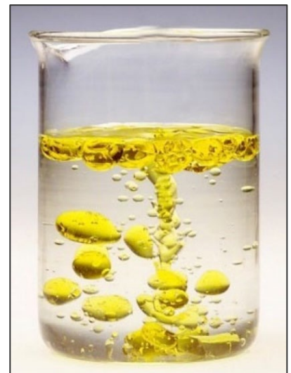
Figure 3: Non-Aqueous Phase Liquid.

Part of the cleanup will also target nearby petroleum hydrocarbon contamination referred to as the LNAPL (Light Non-Aqueous Phase Liquid) source area. This contamination likely came from nearby heating oil USTs that were removed in the past. LNAPL is contaminating the groundwater at the site. LNAPL doesn't mix with water and 'floats' on the surface of the groundwater.