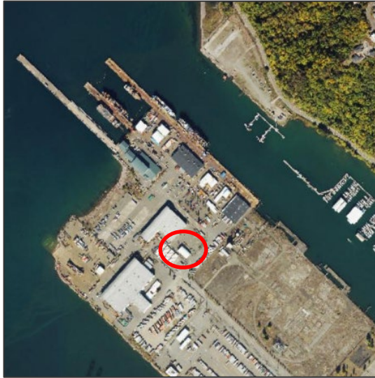
Figure 4: An overview of the site. The area where the Interim Action cleanup will take place is circled in red.

After excavation, contaminated soil will be transported off-site to a permitted landfill. All excavated areas will be re-filled with clean soil, compacted, and repaved as needed.