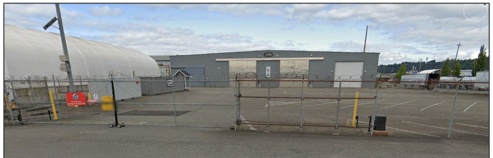
Figure 1: Area of the site where proposed cleanup actions would take place.

No final decisions have been made yet. This public comment period is your opportunity to learn more and share your input. Another comment period will happen before the next phase of cleanup.