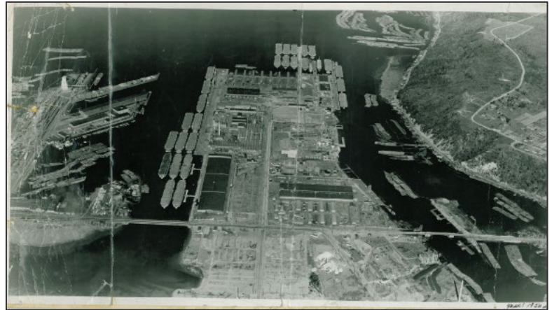
Figure 2: Aerial photo of the site and surroundings taken in 1950.

The Port is planning to redevelop the site to update it for modern marine-related industries. The area is zoned for industrial use, and will be for the foreseeable future.