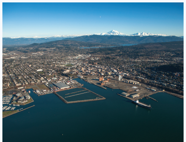
Bellingham Waterfront, December 2014.

ADA Accessibility: Contact Ecology by phone at 425-240-4353 or email at Kristen.Forkeutis@ecy.wa.gov , or visit ecology.wa.gov/Accessibility . For Relay Service or TTY call 711 or 877-833-6341.