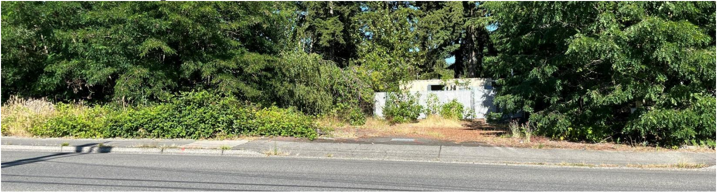
A street view where the Site is located at 24205 and 24225 56 th Ave West