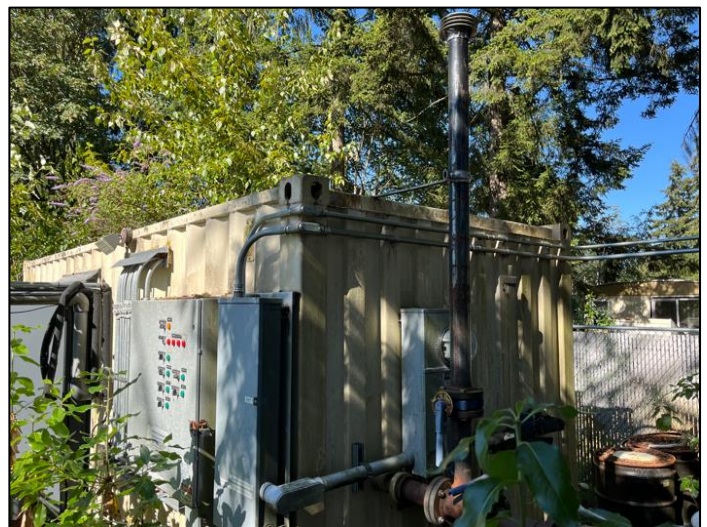
Image of previously used remediation equipment.

In 2012, additional remediation systems were installed at the Source Property, Adjoining Property, and Drake Parcel to remove contamination from deeper soils, groundwater, and soil vapor.