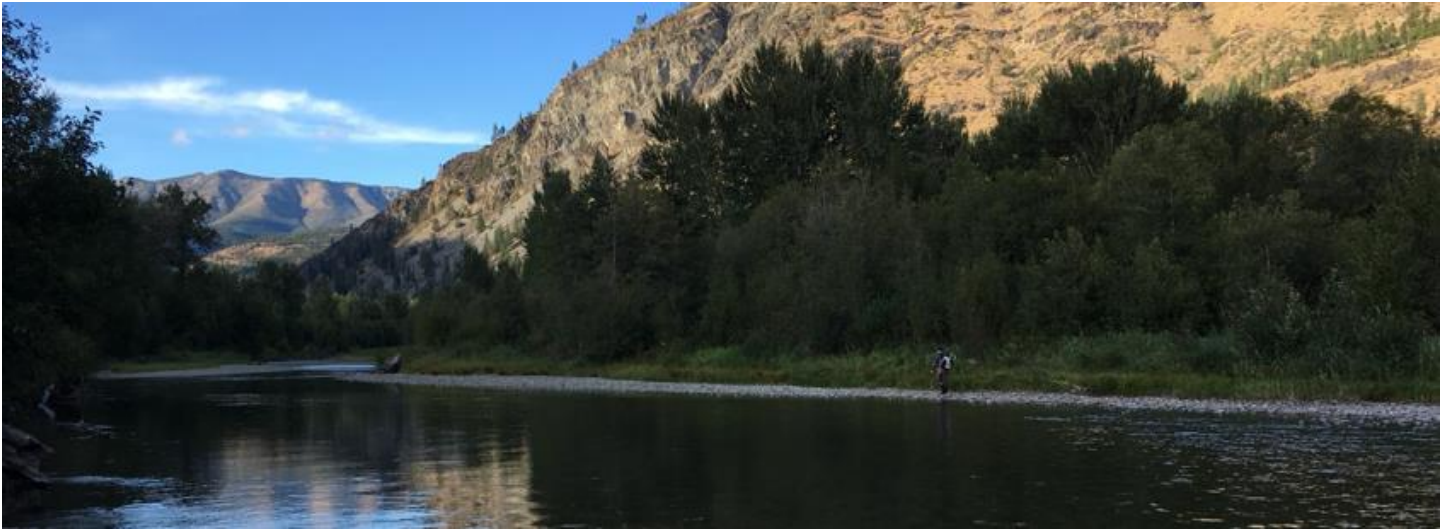
Entiat River, Chelan County