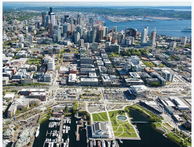
South Lake Union Neighborhood

ADA Accessibility: To request an ADA accommodation, email Augie.Nuszer@ecy.wa.gov , call (425) 533-5537, or dial 711 to call through the Washington Telecommunications Relay for services like text telephone (TTY). Visit Ecology.wa.gov/ADA for more accessibility information.