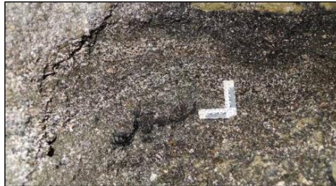
Shell midden with fire cracked rock.