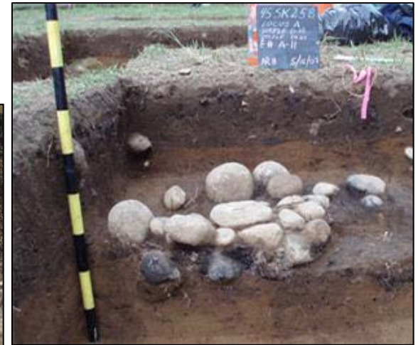
Hearth excavated near Hamilton, WA.