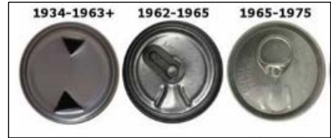
Can opening dates, courtesy of W.M. Schroeder.