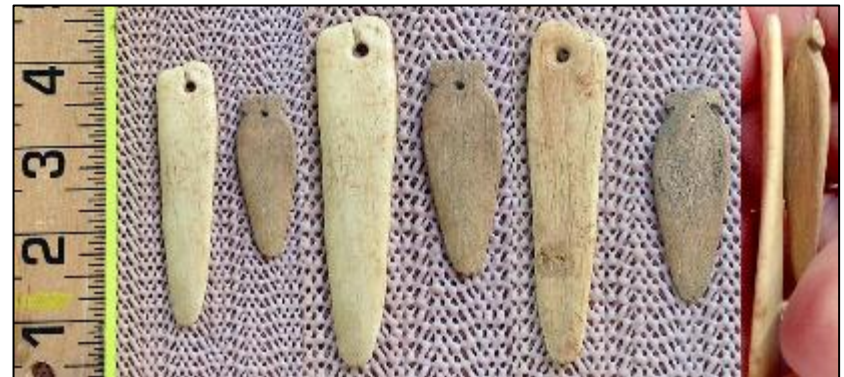
Above: Tooth Pendants. Right: Bone Pendants. Both from Oregon and Washington.