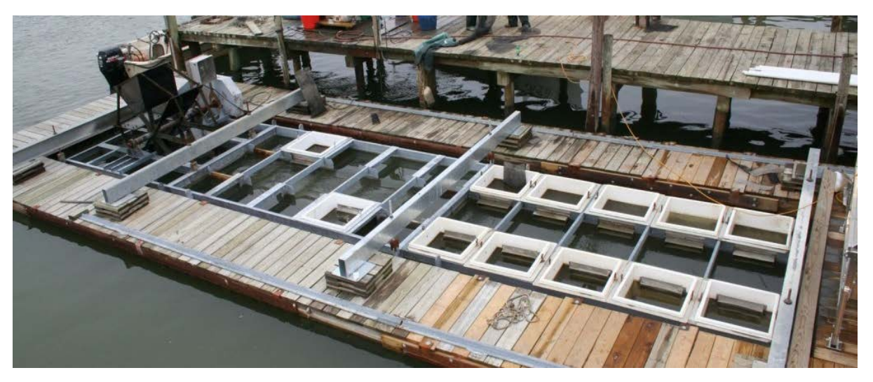
Figure 16-2: This floating upweller system (FLUPSY) is used to raise oyster seed.

SMP Handbook Chapter 8, "Shoreline Use Analysis.")