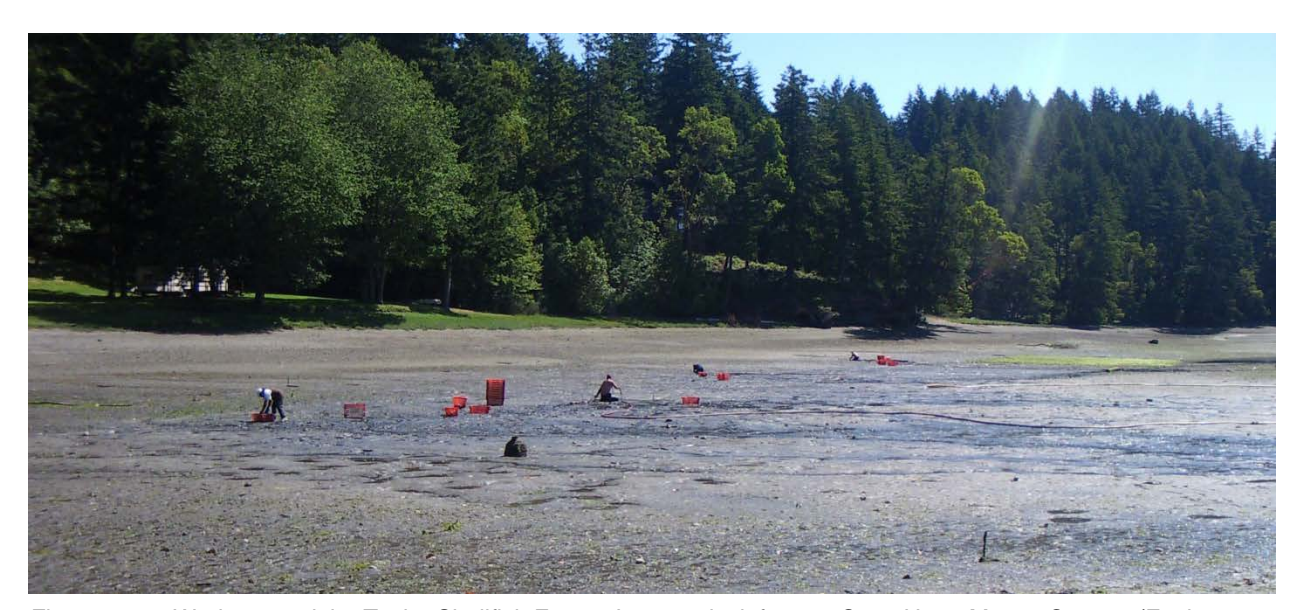
Figure 16-1: Workers tend the Taylor Shellfish Farms, Inc. geoduck farm at Cape Horn, Mason County.

This handbook chapter provides direction to shoreline planners working on SMP updates and amendments and includes information relevant to review of aquaculture permit proposals. This chapter reviews state and national aquaculture policy and the SMP Guidelines. Discussion