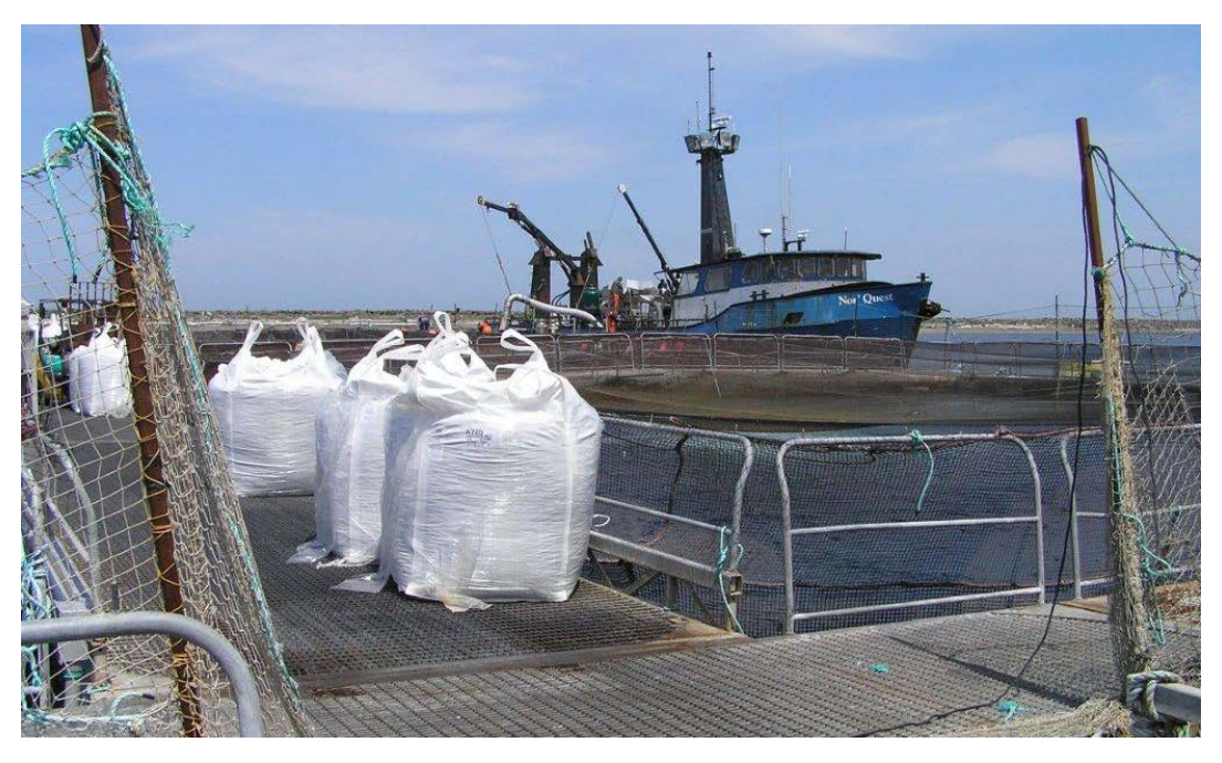
Figure 16-8: White bags of clean nets await installation at the Cooke Aquaculture Pacific (formerly American Gold Seafoods) fish farm near Port Angeles in the Strait of Juan de Fuca.

The Aquatic Lands Act directs DNR to provide a balance of public benefits for all citizens of the state. This includes public use and access, water-dependent uses, environmental protection, renewable resources and revenue generation [RCW 79.105.030].