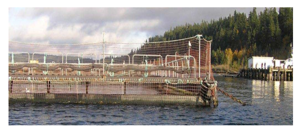
Figure 16-7: Atlantic salmon are raised at Cooke Aquaculture Pacific's (formerly American Gold Seafoods) net pen near Fort Ward, Bainbridge Island.

The culturing and farming of finfish occurs in almost every county of Washington for food production, recovery of native species, research, or supplementing tribal, commercial and recreational fisheries. The potential for offshore coastal aquaculture is being explored through Marine Spatial Planning. When developing policies and regulations for finfish aquaculture, local governments should consider that visual impacts, navigation hazards, boat and onshore traffic, and in-water and onshore structures may be similar regardless of who owns or operates the facility, or if the pen contains native or non-native species.