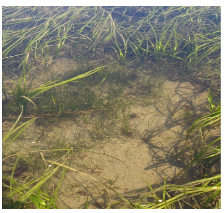
Figure 16-4: Z. japonica and Z. marina form a mosaic. Z. japonica is the shorter and darker eelgrass in the middle.

The aquaculture provisions in the SMP Guidelines state that aquaculture "should not be permitted where it would adversely impact eelgrass"