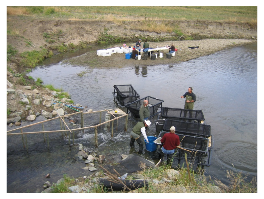
Figure 16-10: At Palmer Lake in Okanogan County, temporary traps are being set to capture and tag Kokanee salmon.

Facilities that meet the definition of aquaculture include 83 state-operated facilities, 51 tribal hatcheries, and 12 federal hatcheries distributed across the state. (See WDFW Salmon Hatcheries Overview.) Hatcheries and in-water acclimation facilities typically include temporary and/or permanent structures. All or part of the use may be water-dependent. In-water acclimation facilities may be used to augment hatchery operations. These facilities temporarily hold juvenile fish, then release them. The process allows anadromous fish to imprint on their natal stream, providing critical cues necessary during their return migration as adults. Non-anadromous species are released in the watershed and remain as recreational catch. Acclimation facilities may be located away from hatcheries, potentially in different shoreline environment designations, watersheds or local government jurisdictions.