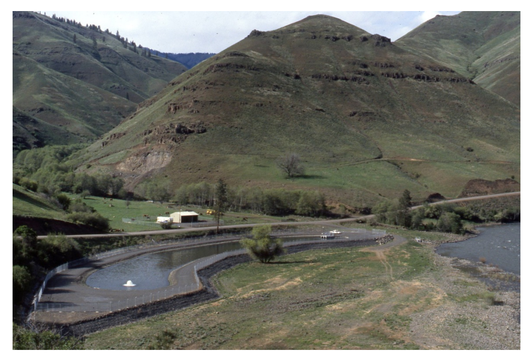
Figure 16-9: The Cottonwood Creek acclimation pond for steelhead at the Grand Ronde River near Anatone, Asotin County, provides steelhead for recreational catch. The pond is operated by WDFW.

Supplementing naturally-spawning and artificial fish stocks through hatcheries and in-water acclimation facilities is a common part of state and tribal finfish management efforts. These facilities meet the definition of aquaculture in WAC 173-26-020(6) and should be evaluated and accommodated, where appropriate.