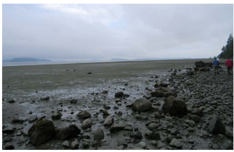
Figure 16-5: A close up of an intermingled eelgrass bed shows taller and wider bladed Z. marina on the surface, and shorter, thinner bladed Z. japonica underneath (left photo). Padilla Bay tideflats contain the largest continuous eelgrass bed in the Lower 48 states, with intermingled Z. marina and Z. japonica (right photo).

The best state source of eelgrass data is the DNR dataset, which distinguishes between non-native and native eelgrass where such mapping has occurred. <u>DNR's monitoring project</u> maps native eelgrass and identifies non-native eelgrass beds, but does not map the shallow edge of non-native eelgrass. <u>WDFW Priority Habitats and Species (PHS) maps</u> also include some data on eelgrass habitat, but do not distinguish between native and non-native eelgrass. (See <u>Appendix 3</u> for data sources.) Local SMP inventory and characterization maps may include both species mapped as one feature or separately. Given the dynamic nature of the extent and location of eelgrass, site specific surveys should be required at the time of project review to determine the current extent and species composition on the project site.