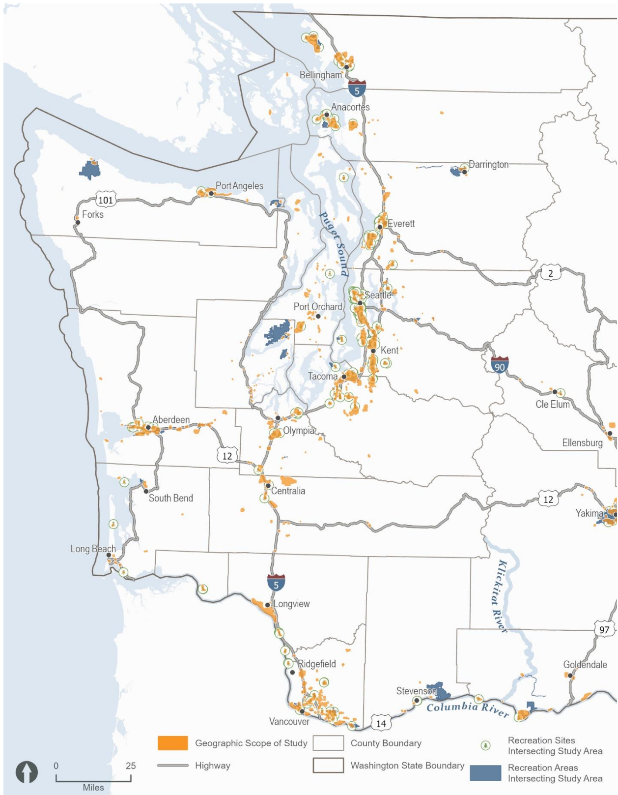
Figure 2. Recreational resources identified by RCO in western Washington

Data source: Washington State Recreation Conservation Office [RCO] 2024